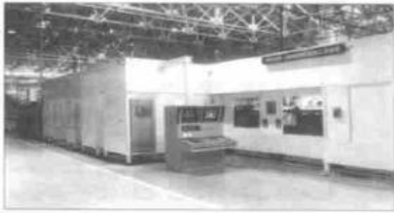
图 2 ZHS- XU86 凸轮轴轴承盖加工自动线 Fig. 2 Automatic line for machining bearing cap of ZHSXU 86 camshaft