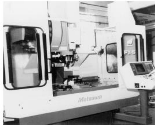
图 1 压缩机外支撑八工位回转工作台组合机床 Fig. 1 Modular machine tool with 8-station rotary table for compressor outside supports